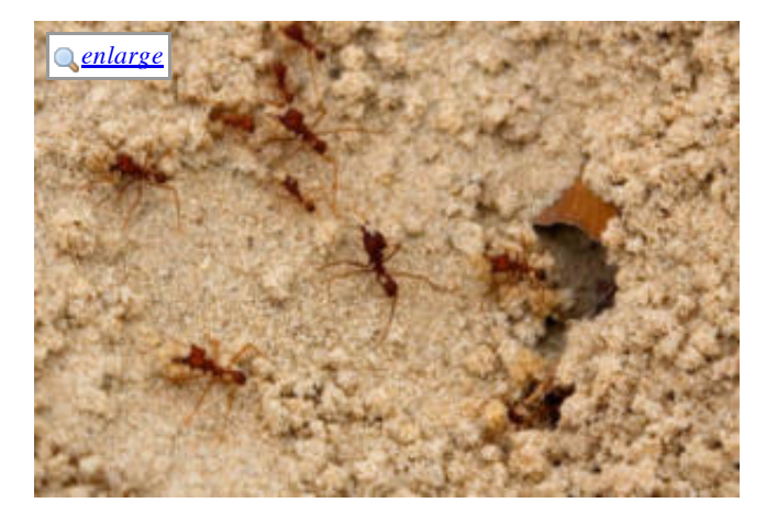
Fire ants.

The two variants, B and b, differ in structure but have evolved similarly to the X and Y chromosomes that determine the sex of humans. If the worker fire ants in a colony carry exclusively the B variant, they will accept a single BB queen, but a colony that includes worker fire ants with the b variant will accept multiple Bb queens. The scientists analysed the genomes of more than 500 red fire ants to understand this phenomenon.